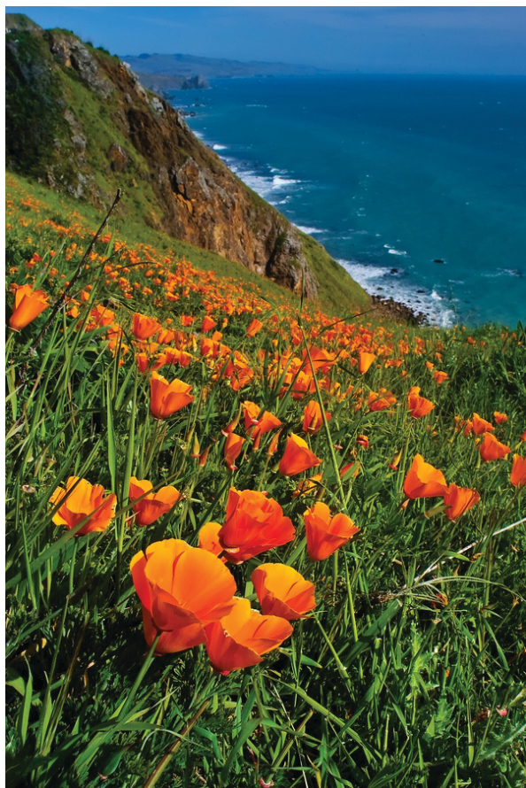
California Poppies on the Sonoma Coast